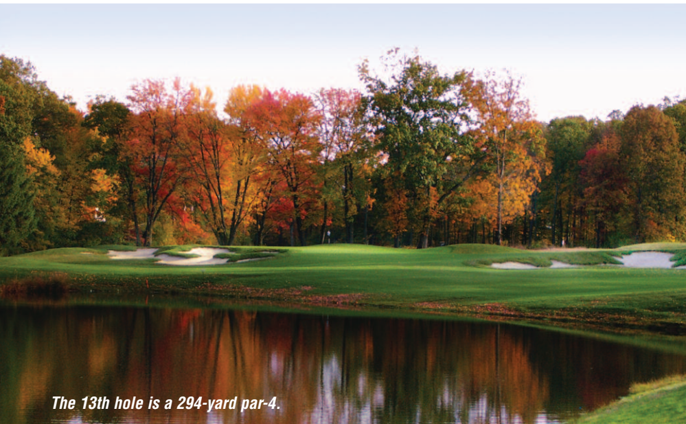
The 13th hole is a 294-yard par-4.

New chapter begins for a captivating course